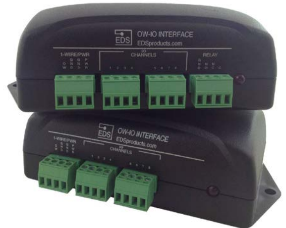
OW-IO-AI8-10V Eight Channel Input With & Without Optional Relay